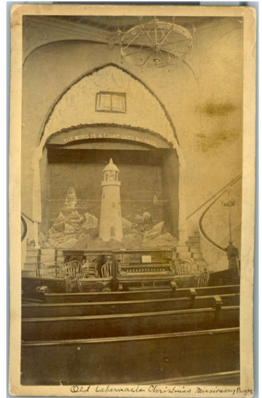
The Dime Tabernacle in Battle Creek, Michigan, December 25, 1888

Though the photo is spotted with time (after all, it's nearly 132 years old!), it still gives us a window into that long-ago Christmas program. From our research, it seems that the Battle Creek Tabernacle Christmas program was regularly mission-focused, and the 1888 program was no different. It ended with an offering call for the support of foreign missions—those at the program donated $2,483.16, with an additional $1,100 donated on December 26, exceeding the previous year's donation by $600. That's a total of $3,583.16. That may not seem like a lot of money today, but adjusted for inflation, the amount is just over $100,000.